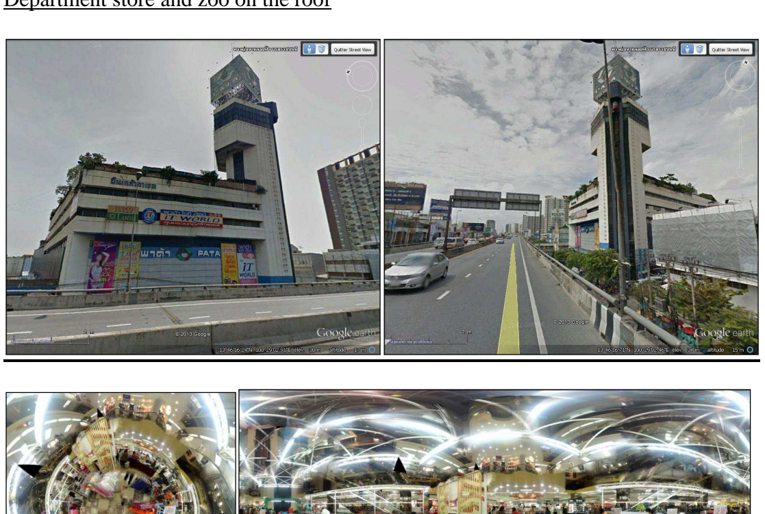
<u>Dairy</u><u>Department store and zoo on the roof</u>